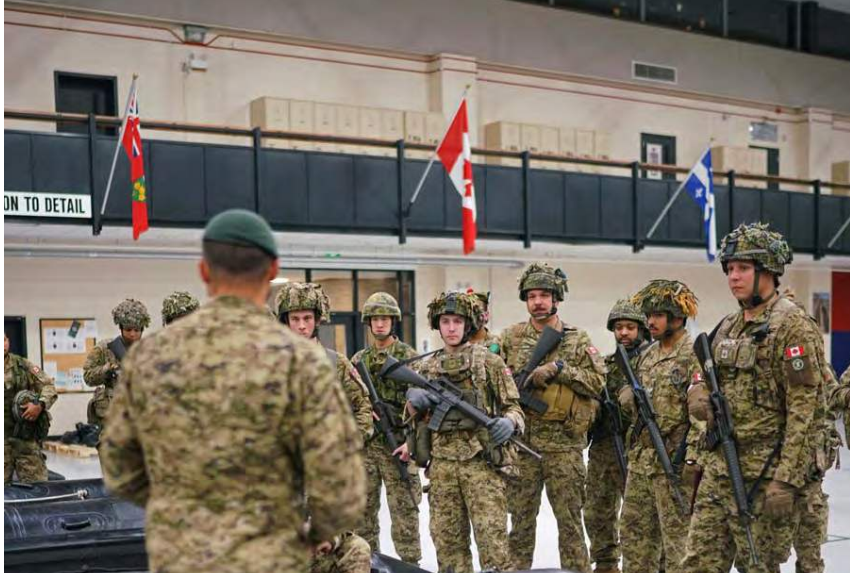
Photo: Soldiers from 32 Brigade learning amphibious boat safety and drills at Moss Park Armouries

Operation "Steadfast Response" took place over the weekend of October 24-26, 2025 and involved upwards of 350 personnel from units within 32 Brigade, with the main infantry component being led by the 48th Highlanders. The scenario for the exercise included training for a "mass casualty" event in the harbour, with the goal of including civilian assets such as Toronto Fire, Toronto Police, Toronto Paramedics, Oakville Search and Rescue (CCGA) and Toronto Search