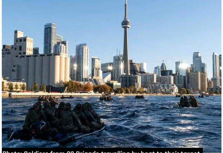
Photo: Soldiers from 32 Brigade travelling by boat to their target during Exercise Steadfast Response.

Our vessel, call sign TSAR2, is tasked by the Joint Rescue Coordination Centre (JRCC) based in Trenton, Ontario, to assist with search and rescue missions. This can involve vessels in distress, people suffering medical issues, and conducting coordinated searches for persons in the water. In between taskings, we spend our time training on the water for the types of scenarios we are likely to encounter. The boat carries a crew of up to six personnel, and the roles on board include Coxswain, Helm, Radio Operator, Navigator and deckhands. Crew members are trained to carry out each of these