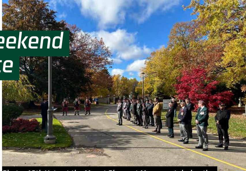
Photo: 48th Vets at the Mount Pleasant Monument during the ceremony on Saturday 8 November.

The weather turned rather abruptly on Saturday evening, with the result that the season's first snowfall (which was a slushy one at that) met all those who gathered at The Regiment's Queen's Park Monument for the November 9 Service of Remembrance. The Regiment, accompanied by both the 48th Cadets and the St. Andrew's College Cadet Corps, marched the traditional