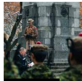
Above photos: From the Queens Park ceremony, CLICK HERE to see more of these photos on our Face- book page.