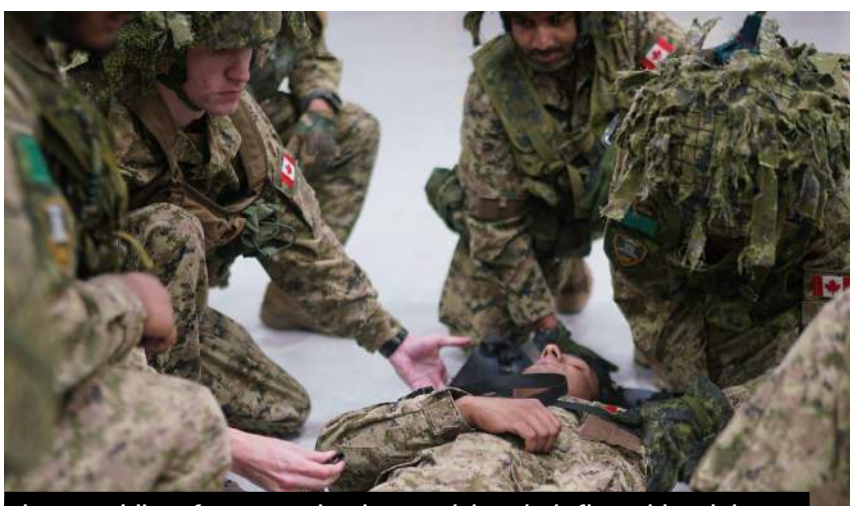
Photo: Soldiers from 32 Brigade practising their first aid training at Moss Park Armouries

and Rescue-Marine (CCGA). The HQ for the Ex was HMCS York, and the troops deployed from that location. The amount of planning and coordination that went into this exercise was considerable, and the lessons learned were valuable for all involved. It was impressive to see the Infantry, Combat Engineers, Signallers, Medics, Navy and Coast Guard all working together.