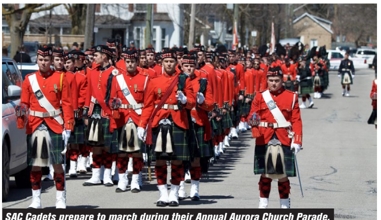
SAC Cadets prepare to march during their Annual Aurora Church Parade.