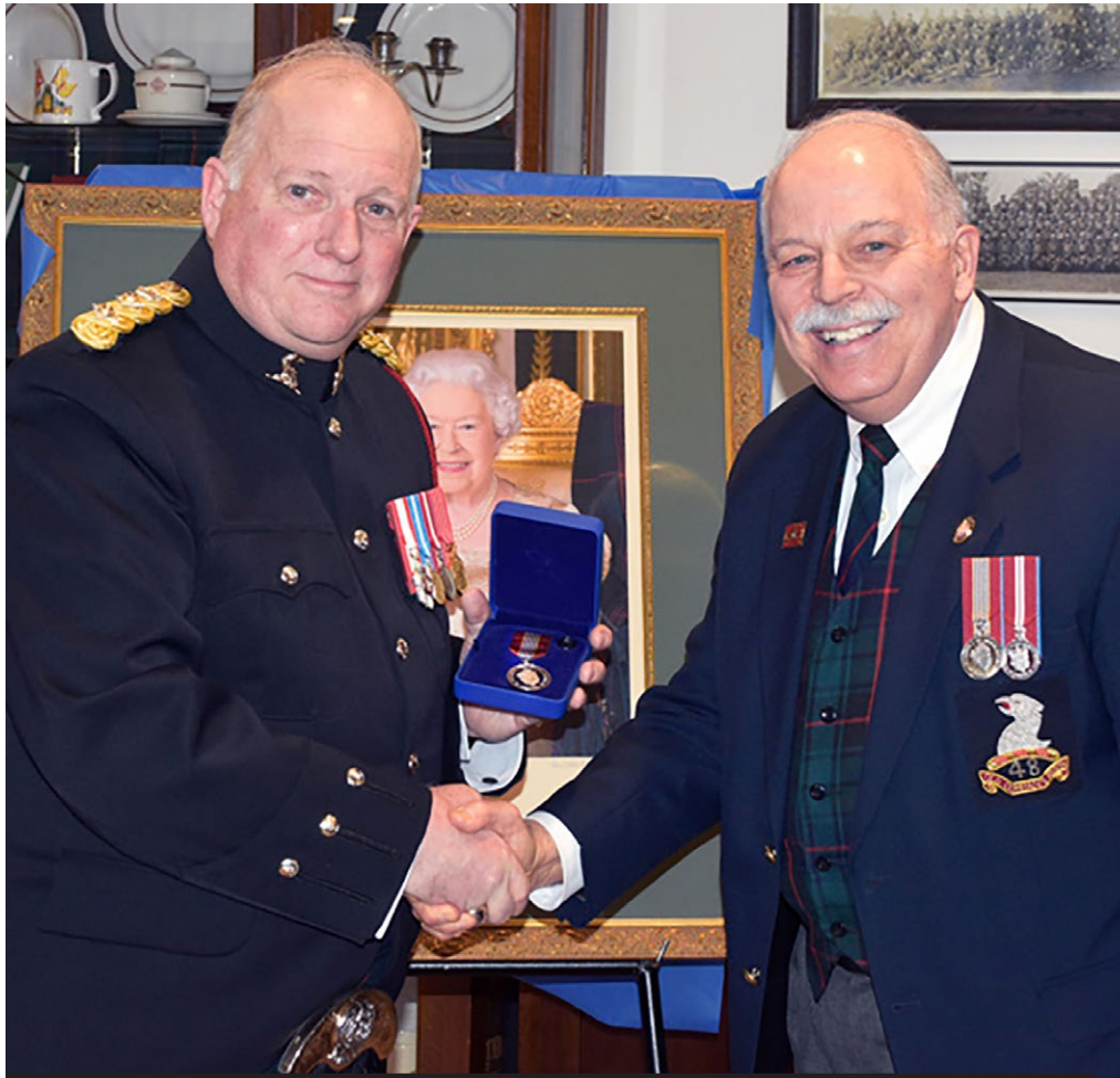
The Sovereign's Medal for Volunteers recognizes the exceptional volunteer achievements of Canadians from across the country in a wide range of fields.