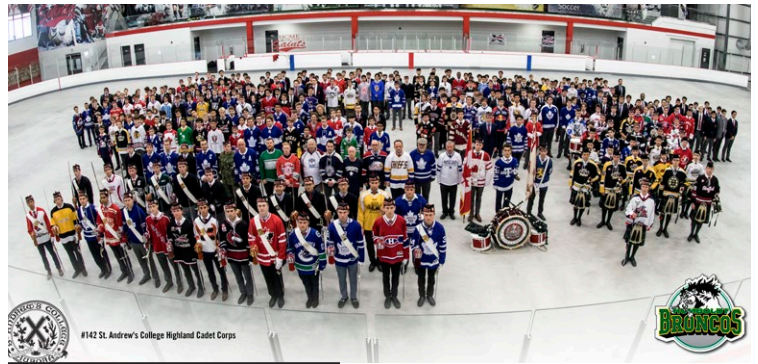
Humboldt Tragedy Memorial Parade