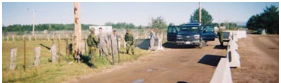
Members of the 48th searching locals and their vehicle before allowing entry to the camp.