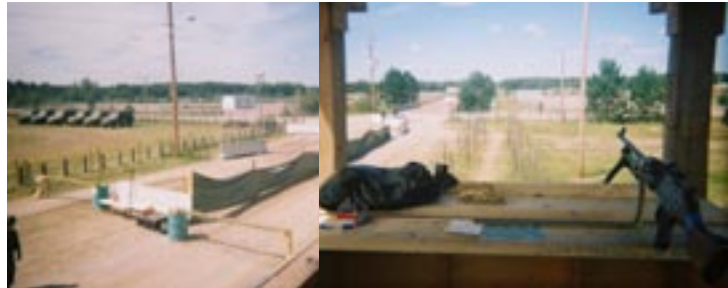
The front gate of forward operating base Steadfast.