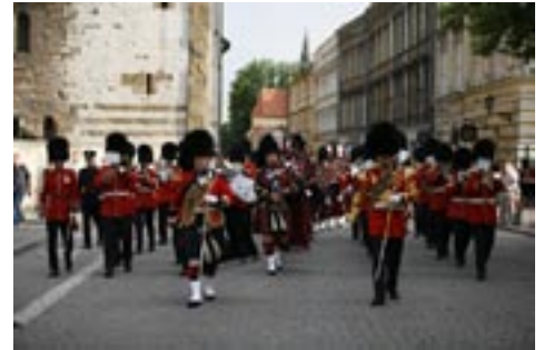
48th and Royals marching in Krakow, Poland.

During the day of the 25 th , quite a number of members went on a side trip to visit the concentration camp at Auschwitz. From all accounts this was a very moving experience. Because space was limited, others visited Wawel Castle in Krakow instead. This was a most interesting tour.