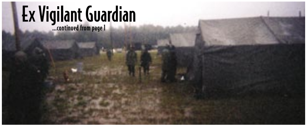
The weather during the 1st two days of Exercise Vigilant Guardian.