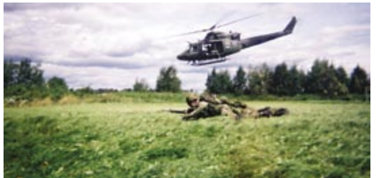
Cpl Duff's chalk practicing hel ops.