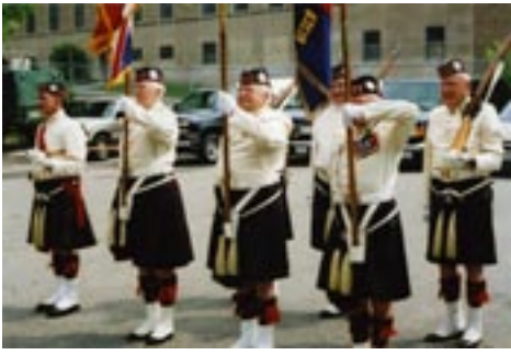
O.C.A. Colour Party at Belleville