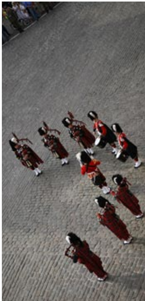
Above and below: Pipe Band performing in Warsaw.