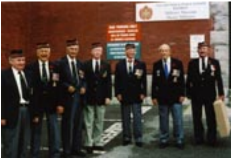
Before Parade at Belleville