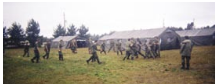
The 48th carrying on the "salots" tradition at the end of the ex.