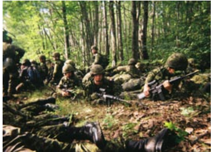
Delta coy re-organizing post hel ops.