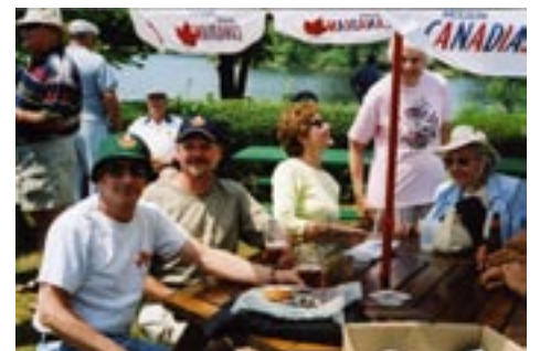
A bunch of guys were whooping it up.