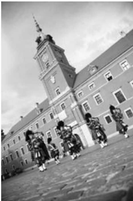
Pipe Band performing in Warsaw.