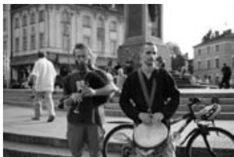
New recruits for the Pipe Band in Warsaw, Poland.