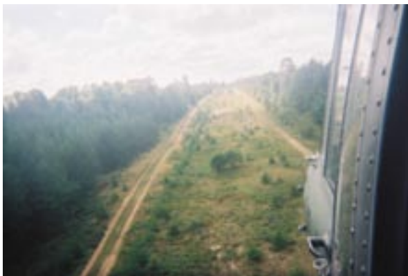
Contour flying at 100 knots