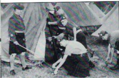
◀ Summer Camp during the 1950s