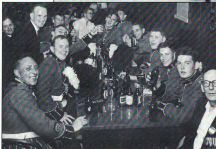
▲ Reunion Smoker – 1966.