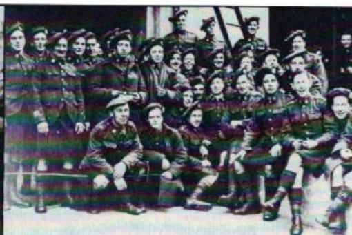
▲ "Homeward Bound" 15th.Bn. 1919 ▲