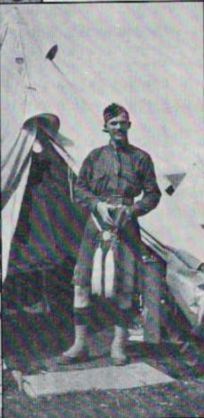
◀ Summer Camp, pre-World War I.