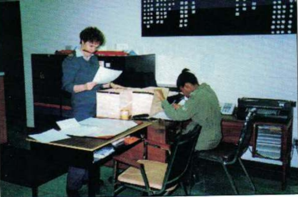
▲ The unit's regular force Administrative Assistant helps to process paper work in BHQ.