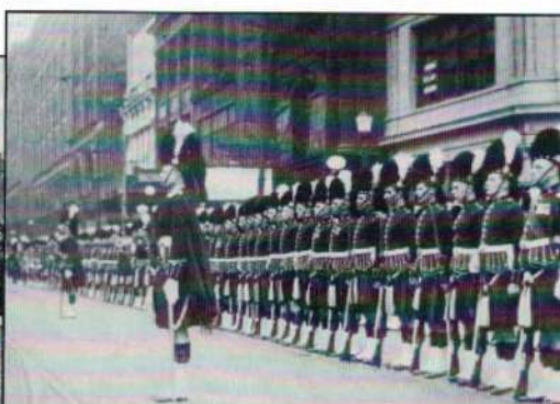
▲ On parade at the Chicago World's Fair – 1934.