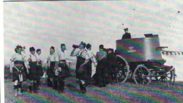
◀ Long Branch Camp, Toronto. 48th Highlanders filling water bottles, 21 August, 1914.