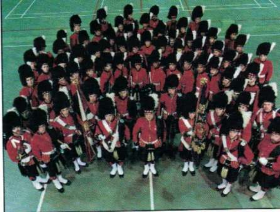
▲ Guard of Honour - Royal Winter Fair, 1990