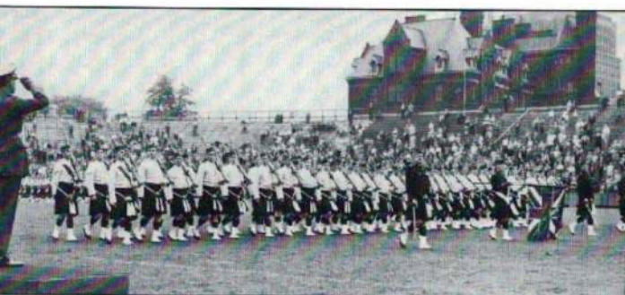
▲ Trooping of the Colours, Varsity Stadium – May 1951.