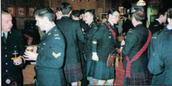
▲ Season's Greetings: All ranks enjoy a pre-dinner drink before the annual Battalion Christmas Dinner.