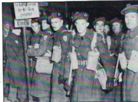
▶ Highlanders support Nato. 27 Brigade, 1951.