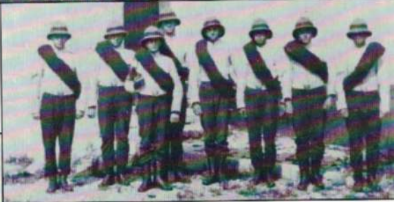
▲ Guard at the wireless station, Hanlan's Point 1914.