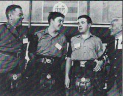
▲ The Elms Clan – 1971