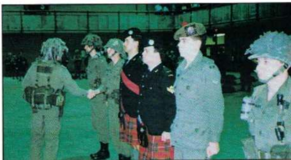
▲ Promotions – The Commanding Officer congratulates members of all Battalion sub-units.