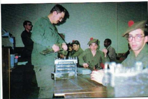
▲ Members of C Company prepare for a Communications lecture.