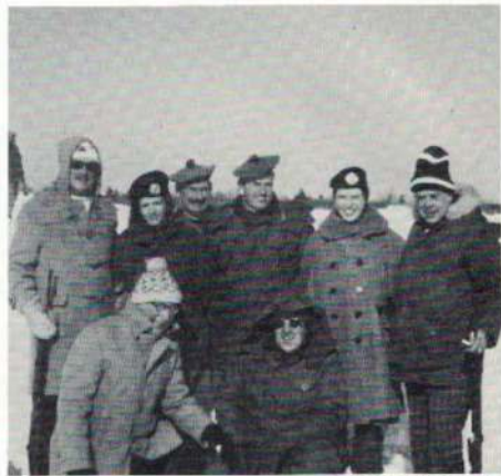
TURNER SHOOT: BORDEN What kind of an army is this?