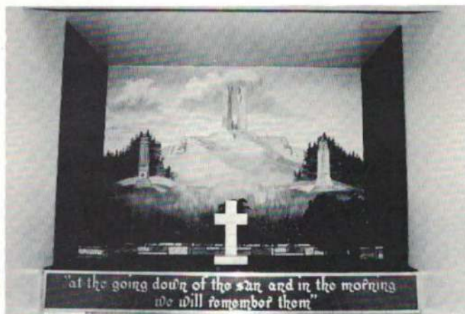
MEMORIAL HALL DEDICATION: Courtesy Len Falkner.