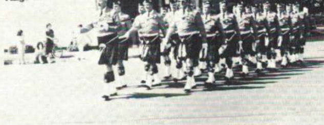
OCA GUARD: Winning another first in Niagara Falls N.Y., June 1978.