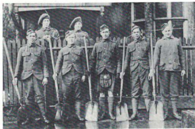
AT EASE: Fatigue Party, 134th Bn. 1915